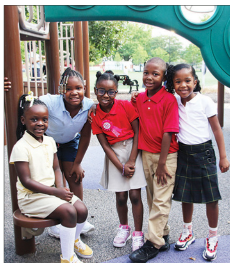
City Academy, a top YouthBridge donor supported nonprofit, fosters high performance, creative thinking and a love of learning.