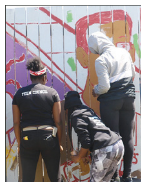
Youth artists of Story Stitches share their message of peace across St. Louis.

YouthBridge Community Foundation partners with individual and community donors on how to turn their passions into philanthropy and works with nonprofits serving children and youth on how to be more successful and sustainable. Together, we are realizing the potential of our region.